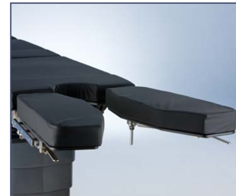
Split Leg Section, pair. Code 60160