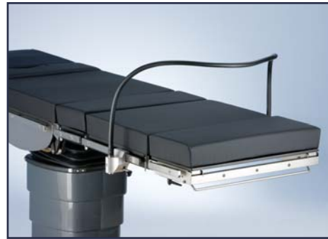
Anaesthesia frame, flexible, clamps included. Code 10311