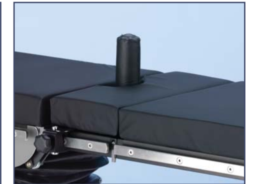
Perineal post with cushion. Code 60115. Requires clamps 61264.