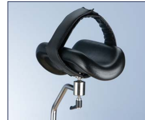
Padded strap for leg holders. Code 10452