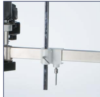
Clamp for orthopaedic attachment. Code ES106