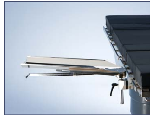
Armboard with one hand balljoint release, clamp included, without cushion. Code 10380. Model 6010387 includes also a rotatable clamp function.