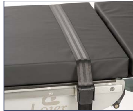
Legstrap with clamps, pair, clamps included. Code 10372