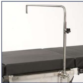
Anaesthesia frame, clamp included, code 10310. Optional extension arm available, code 60328