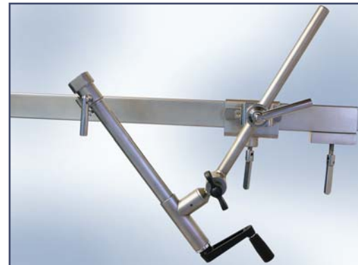
Tilting tractor for orthopaedic attachment. Code 60291