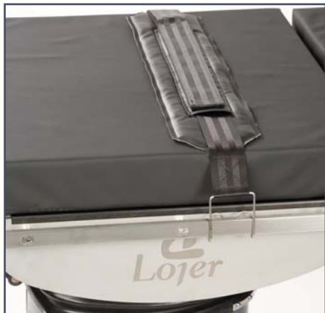
Padded Leg and Body strap, wide. Code 10464