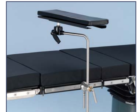
Multi-Task Armboard, lockable ball socket combined with 15 cm of horizontal travel. Code 60322.