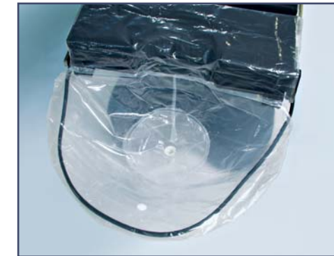
Uro Catcher System (code 60324) provides excellent fluid containment. Flexible drape support frame provides unobstructed surgeon access during manipulation and springs back to its original state. Compatible with all suction systems for accurate fluid measurement and metering. Sterile bags (10 pcs), code 60235.