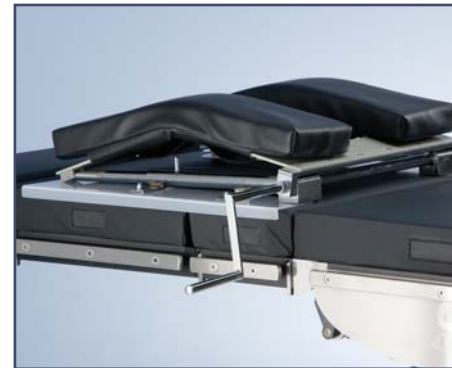
Laminectomy frame, pair of cushions with abdominal cut out, manually operated, code: 6010485