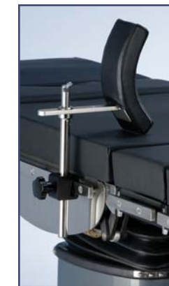
Lateral support, narrow. Code 61406