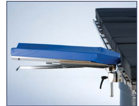
Comfort cushion (concave) for armboards, code 10382H