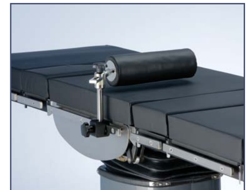
Supporting Roll, horizontal. Code 10369