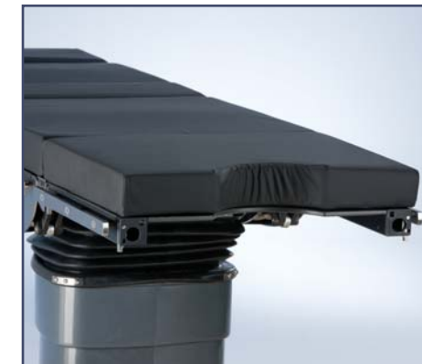
Scandia Gynecologic/urologic section 400 mm (female/female). Code 60150