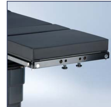
Adapter for special head rests, Mayfield® compatible. Code 60110