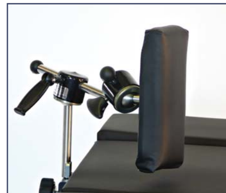
Lateral support, rectangular swivelling soft pad. Code 603212. Requires clamp 60200.