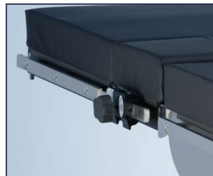
Easy lock blade clamp for accessories with flat mounting blades. Code: 60200