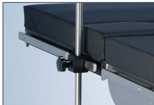
Rapid rod clamp, aluminium. Code: 61264