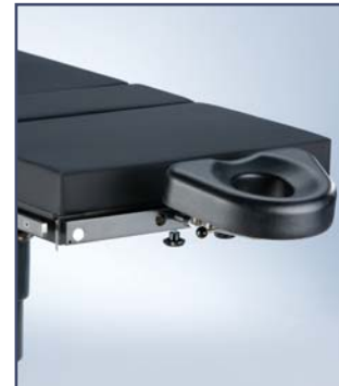
Flexible head support for ENT-, plastic and eye surgery. Code 60327. Requires adapter 60110