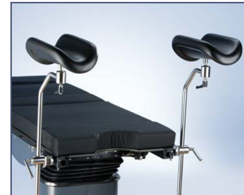
Leg holders with ball joint, pair. Code 10450