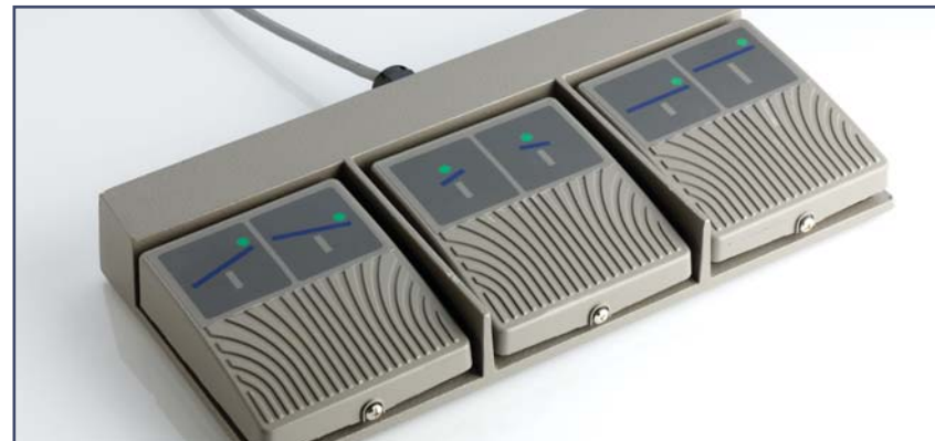
Scandia Foot control unit, three programmable functions. Code 60270