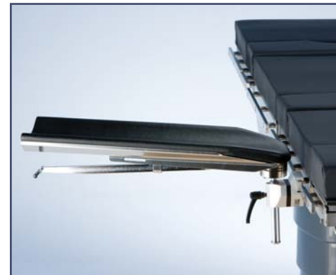
Concave cushion for armboards, injection molded. Code 10382