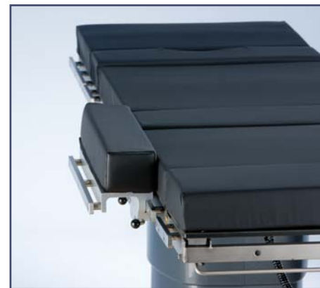
Table width extender (pair, includes clamps and cushions), length 500mm. Code 10423