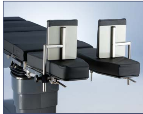
Foot supports, pair. Code 7510175