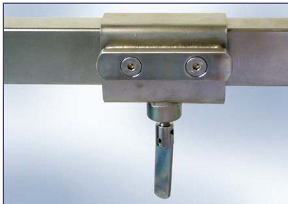
Extension bar accessory rail. Code ES15334