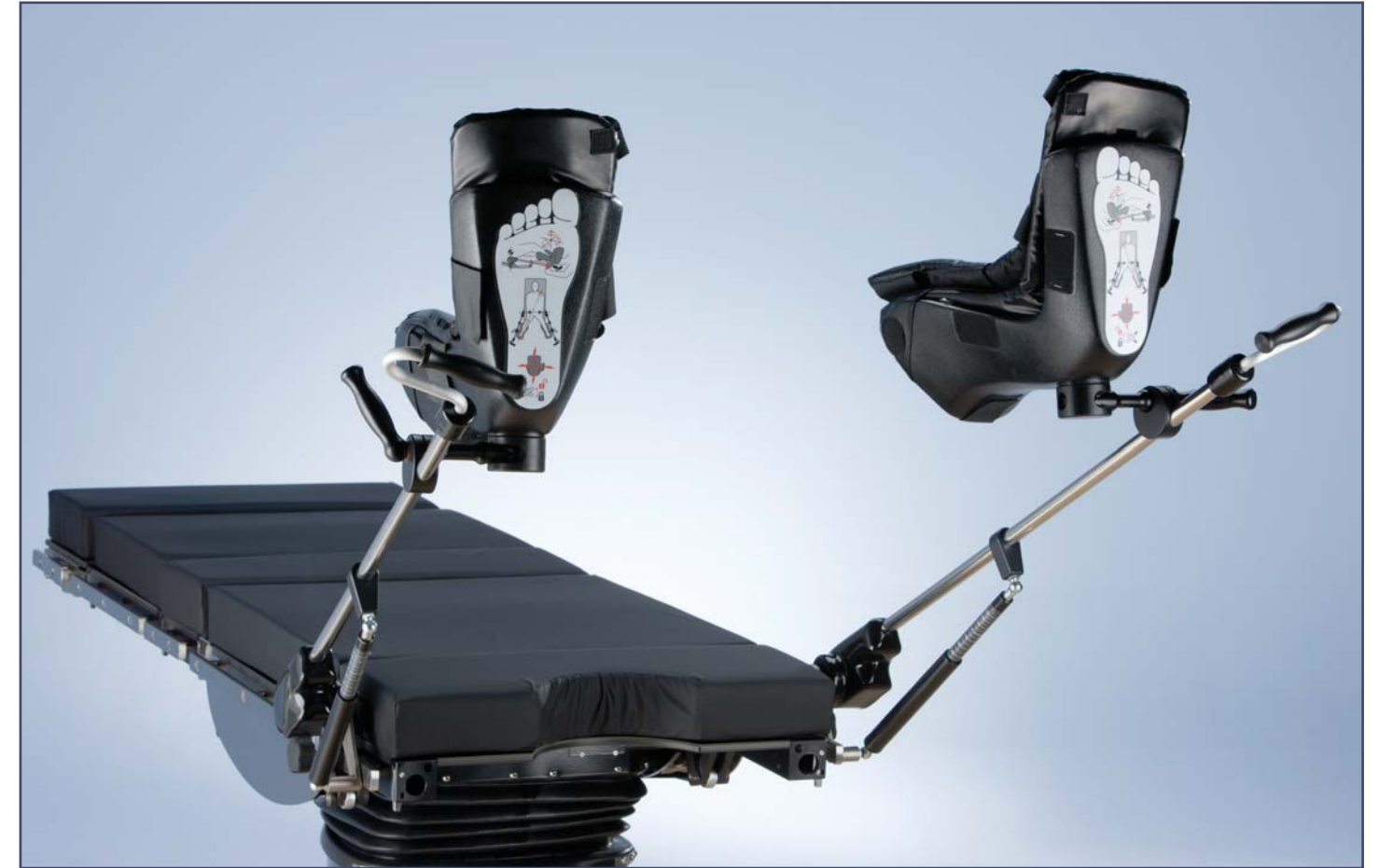
Gas spring assisted 3D soft pad stirrups, pair. stirrups allow for easy adjustment of abduction and lithotomy while maintaining the sterile field. They enable safe and easy positioning while providing enhanced surgical site access. Code 60320. Requires clamps 60200