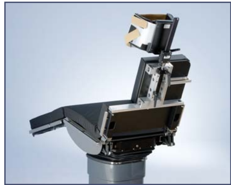
Scandia Back plate module for shoulder surgery, electrically adjusted with removable side plates. 3D adjustable head support with comfort cushions. Code 60280