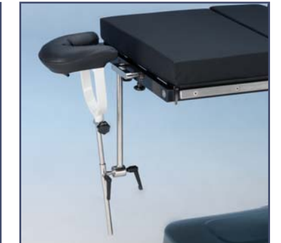
Head rest for neurosurgery. Code 6010335. Requires adapter 60110