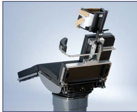
Side support for Shoulder surgery device, code: 602801