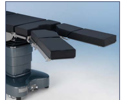
Divided leg section, dual joint abduction. Code 60161