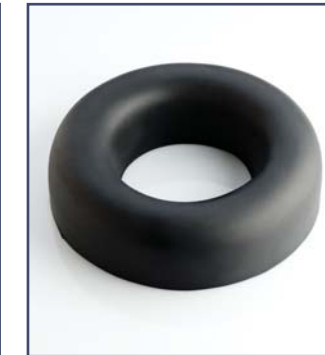
Circular head cushion. Code 10333