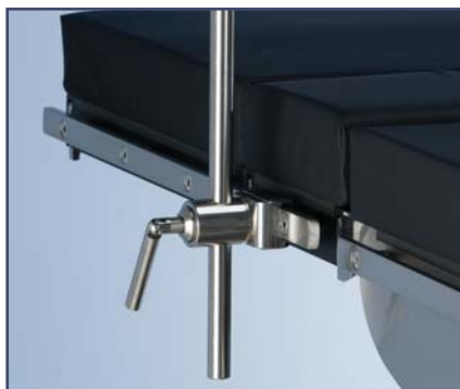
Rotary rod clamp, stainless steel. Code: 61283