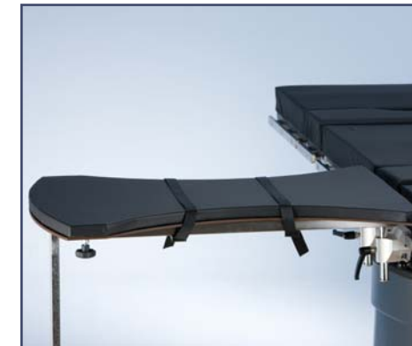
Arm and hand surgery table with detachable supporting leg, clamps included. Code 10390