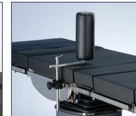
Supporting Roll, vertical. Code: 61421