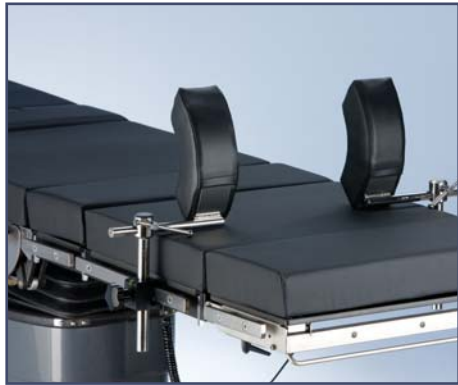
Shoulder Support, pair. Code 61253