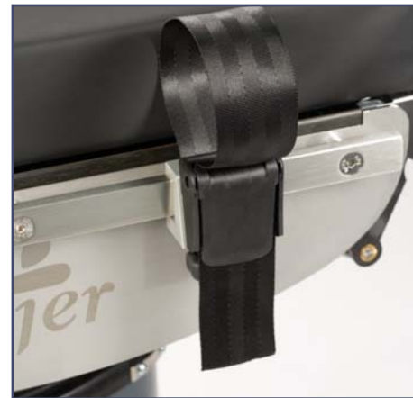
Wristclamp with strap, clamp included. Code 10370