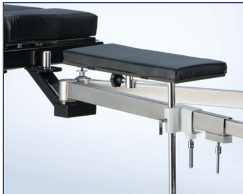
Leg board with cushion. Code 61120110