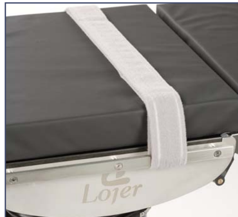
Patient restraint strap with Velcro. Code R7842