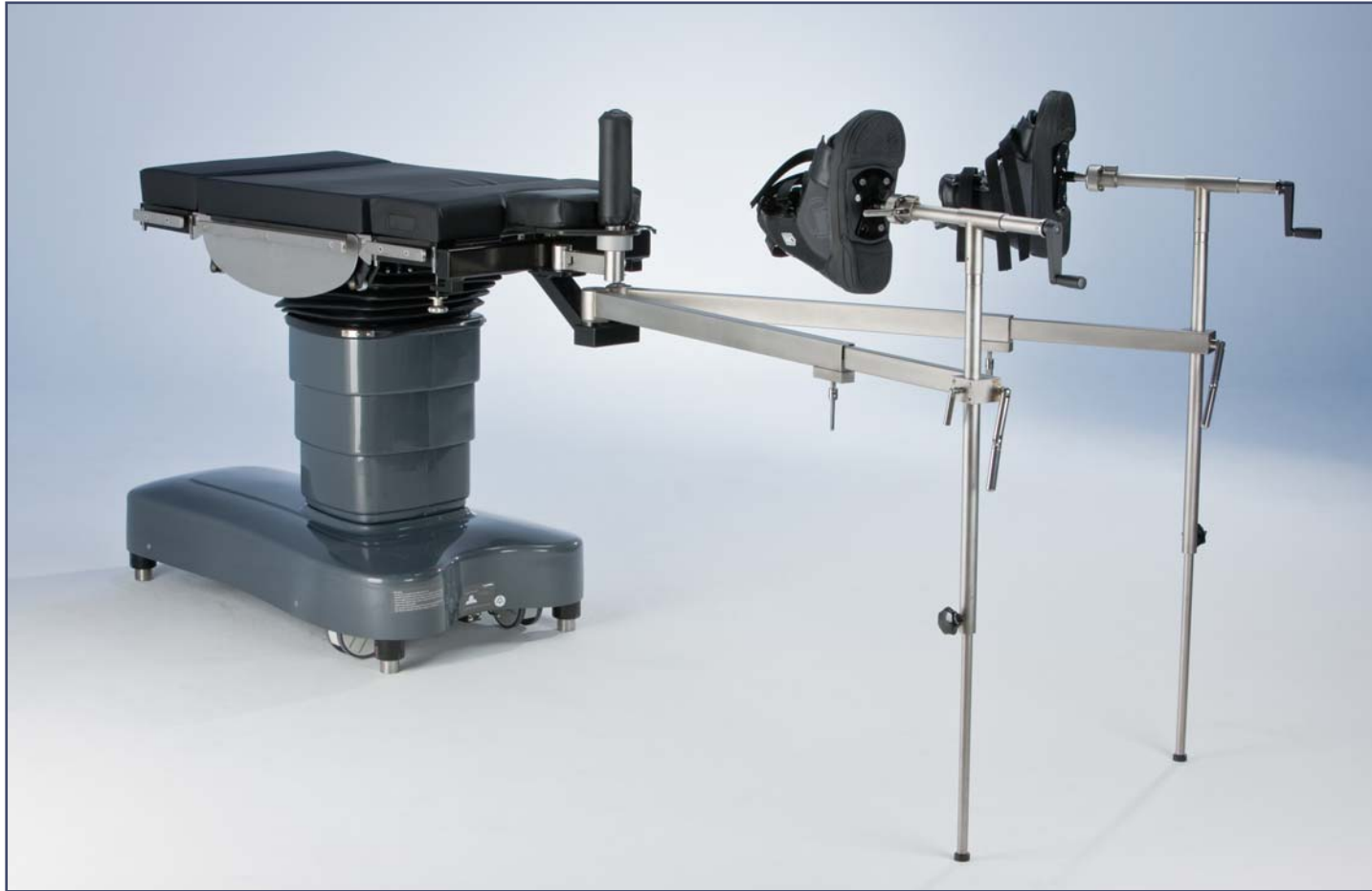
Orthopaedic extension device for orthopaedic operations and traumatological treatment of fractures. Code 60290