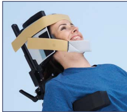
Straps for head support (12pcs package). Code 602804