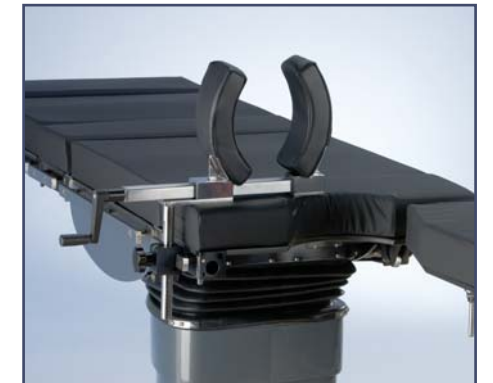
Arthroscopic leg holder. Code 6128920