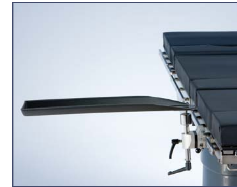
X-ray transparent Armboard, clamp included. Code: 10385