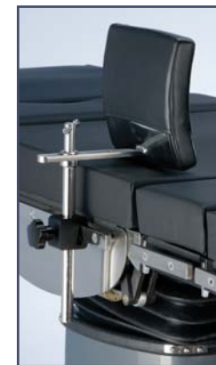
Lateral support, wide. Code 51461416