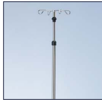
Infusion stand Ø 18 mm, stainless steel. One hand height adjustment. Code: 60120. Mobile Infusion stand, stainless steel, castors 5 x 80 mm. One hand height adjustment. Code: 60130