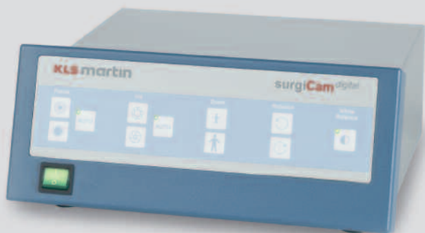
Control unit, front

TheurgiCam control unit allows manual as well as automatic control of all camera functions.