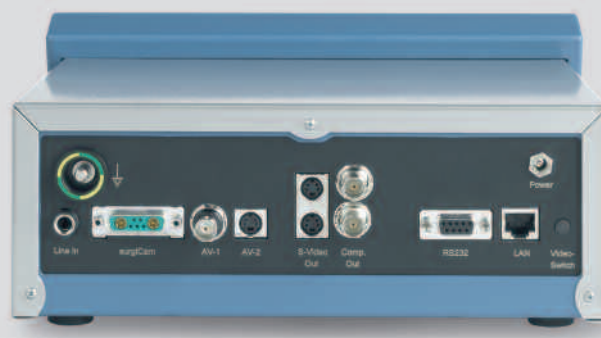
Control unit, rear

TheurgiCam control unit allows manual as well as automatic control of all camera functions.