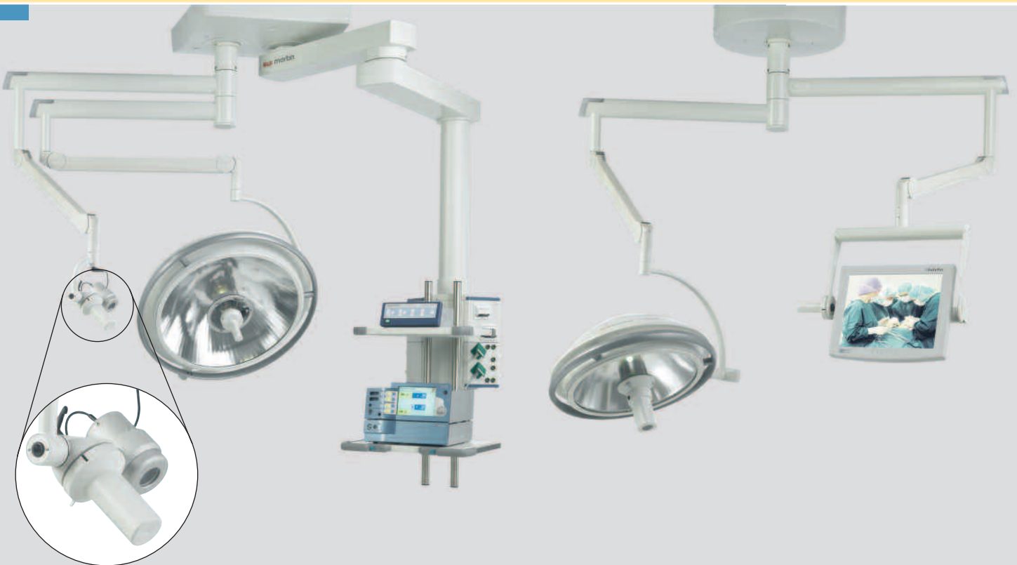
surgiCam basic version

The Basic version offers you excellent image quality along with a separate, user-friendly control unit that can be installed either on the platform of a ceiling-mounted supply-and-suspension system or on an equipment trolley. It provides you with a number of additional control functions and allows optional switchover to up to two other video sources (e.g. an endoscopic and a room camera).