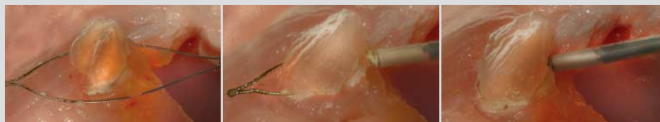
Step 1: resection